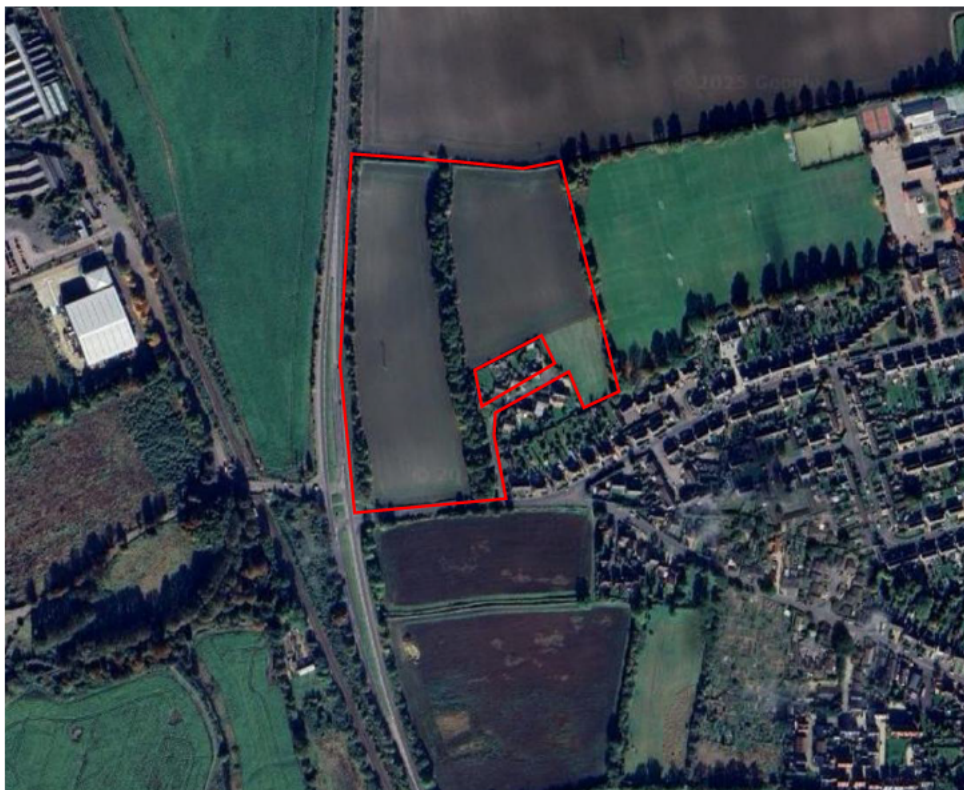
Figure 2: The Site Location with closer aerial view