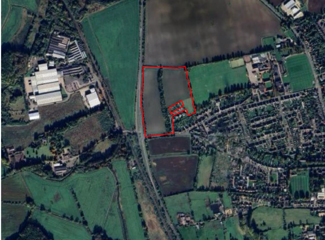
Figure 1: The Site Location with wider aerial view