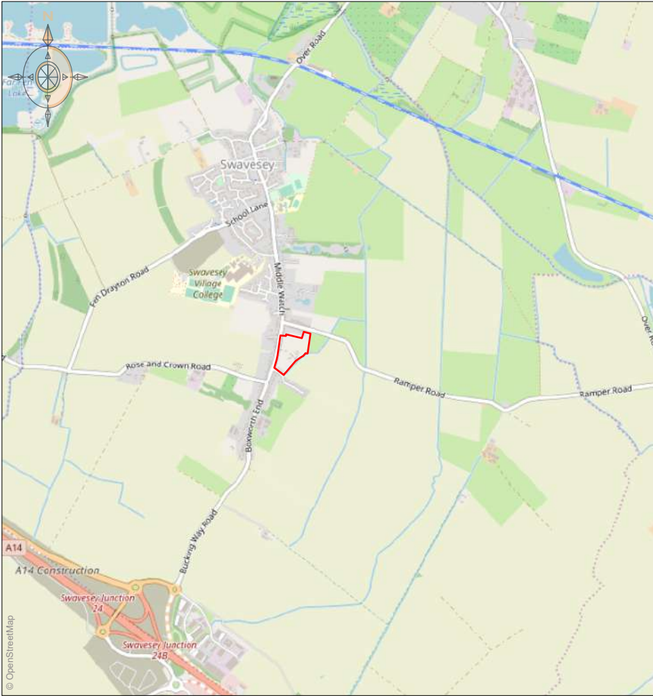
The site in context