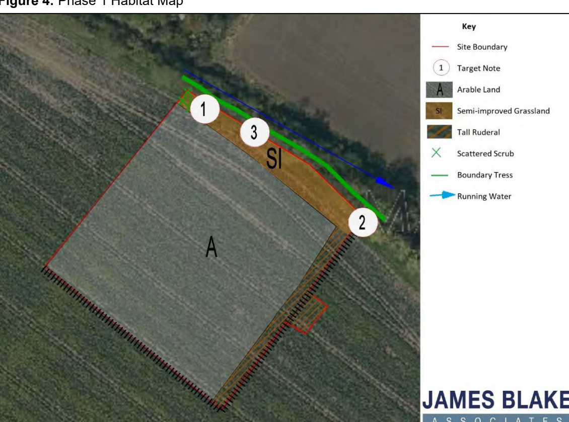
Figure 4: Phase 1 Habitat Map