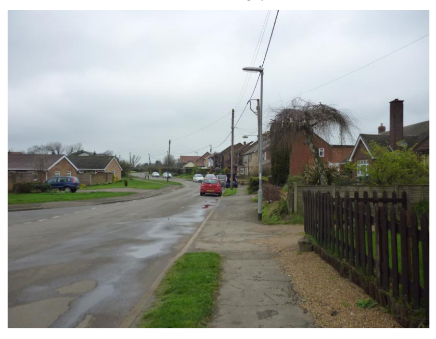
View along Cinques Road

not impede any key views from the village into the surrounding countryside, but will create views from the development to the open fields to the north and east and Gamlingay Wood further to the east.