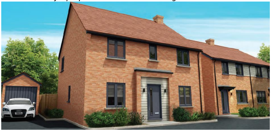
Visualisation of a proposed 4-bedroom dwelling