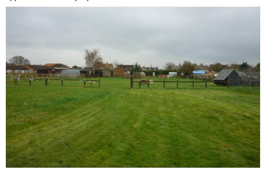
Site looking southwest towards Cinques Road

The topography of the site and the surrounding area is relatively flat. The Draft Village Design Guidance confirms that the area is of predominantly rural character with arable farmland, market gardens and pasture. The site includes garden land and a paddock. To the east there are open fields with Gamlingay Wood beyond. There is new residential development nearby to the south east, which has a landscape buffer between the residential development and adjacent fields and this approach would be proposed at thus site.