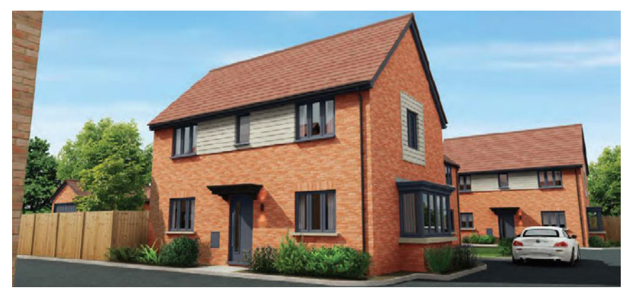
Visualisation of a proposed 3-bedroom dwelling