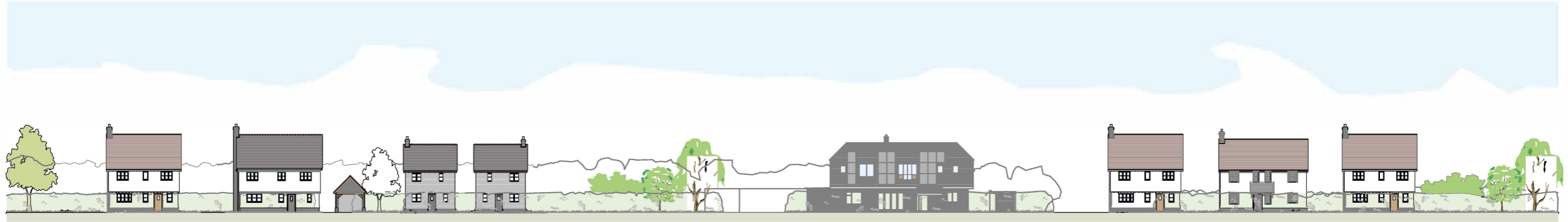
1:500 PROPOSED STREET SCENE