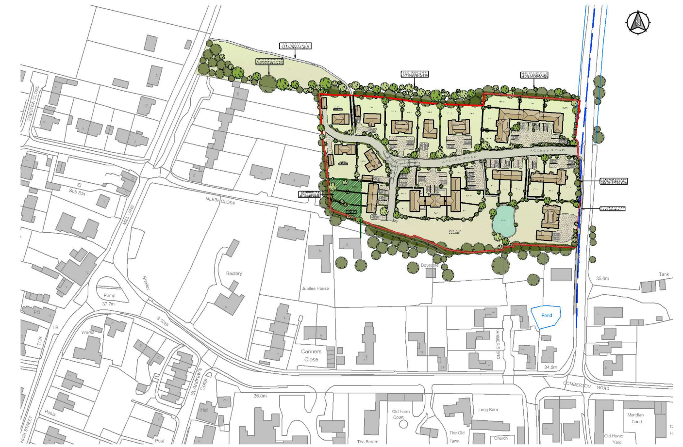
1:2500 PROPOSED SITE LOCATION PLAN