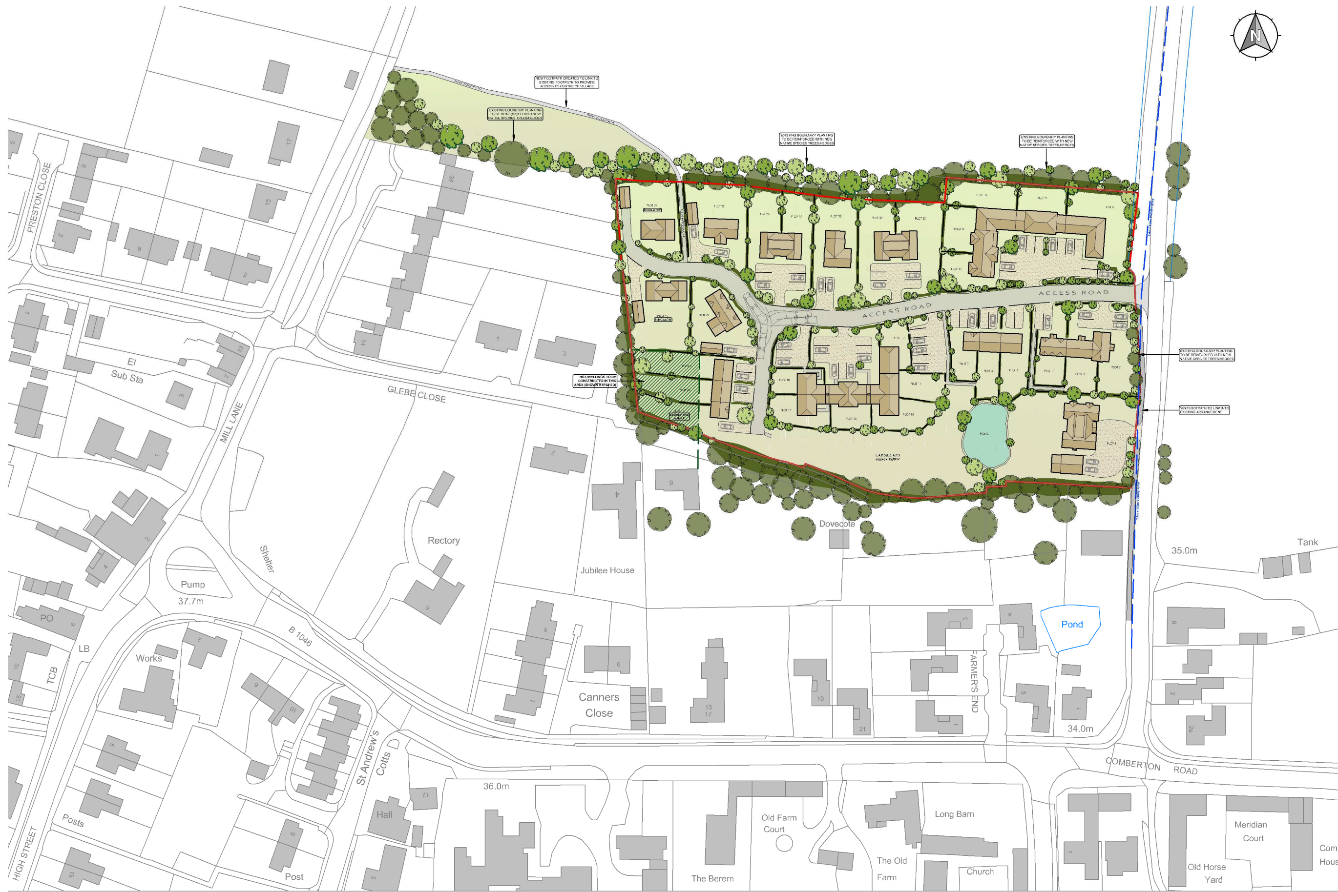
1:1250 PROPOSED BLOCK PLAN