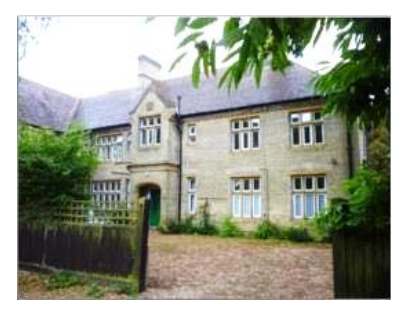
St. Marks Vicarage