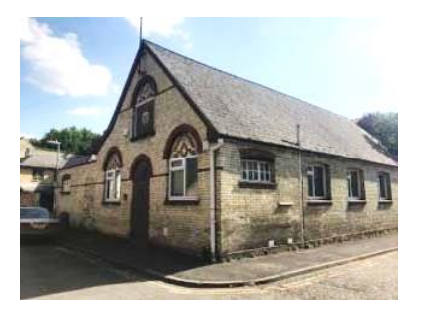
Newnham Croft Social Club

3. Newnham Bakery (H3), no. 7 Derby Street, forms an integral part of the west side of Derby Street. References to a bakery at the premises at Hope Cottage No.7 Derby Street suggest it goes back to 1861, making it the first shop in Newnham. Before WWII, it was referred to as the 'Bakehouse'. The exterior of the building is almost unchanged over the years, although the brickwork was painted at some stage and the shop window widened by taking in a door on the right that led upstairs. With its original oven and tall chimney, it has continued as a bakery with a variety of owners. It has now also become a popular café.