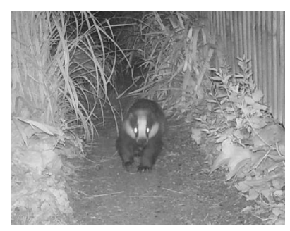
BADGER IN SNICKET 1.15AM