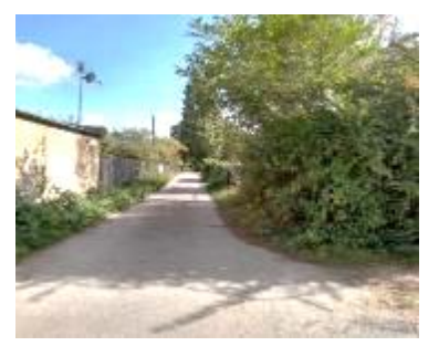
LAND BEHIND SELWYN RD

3.3.4 Off Kings Road there is a lane (Mud Lane) leading to Downing College playing field with a gate through to Millington Road alleyway. This is a safe route for cyclists and walkers to travel to and from Newnham Croft via Marlowe Road. Map Ref L4.