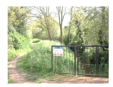
Track Leading to Barton Road