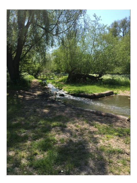
THE RUSH STREAM

Otters have returned and Water Voles have been increasing in numbers along the banks. This site, and the adjacent Coe Fen, are home to some of the most spectacular veteran Willow trees in Cambridge. Charles Darwin is reputed to have conducted many Beetle surveys here. The Rush is a small stream carrying water from the main river to the Granta millpond. It has recently been restored to improve water flow and conditions for the many small Fish which breed here. (Appendix 1)