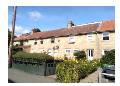
Selwyn Road, north side