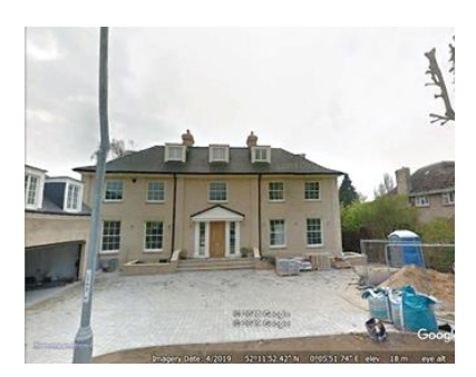
No 95 Barton Road