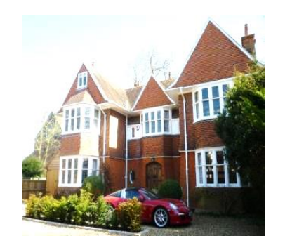
No 3 Millington Road

B.3.3 Late Edwardian style. Red brick facades pitched slate roofs, front bays and sash windows. Large detached and semi-detached houses.