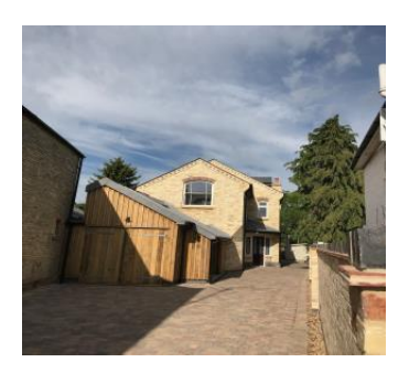
New build in back garden