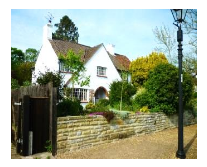
No. 28 Millington Road

B.3.3 Late Edwardian style. Red brick facades pitched slate roofs, front bays and sash windows. Large detached and semi-detached houses.