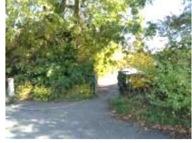
Lane linking Kings Road to College playing fields and via Millington Road to Newnham Croft