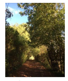
LANE FROM GRANTCHESTER MEADOWS TO PLAYING FIELDS