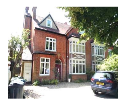
No 71 Barton Road

B.3.4 1920's Mixed Styles. Individual architect-built house designs, with a range of Tudor, Georgian and domestic influences.