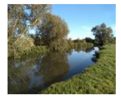
River Cam, Paradise Nature Reserve and Grantchester Meadows