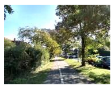
Barton Road cycle/pedestrian route