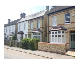
Nos. 38-48 Grantchester Road

C.3.3 Edwardian style semi-detached and terraced houses. Mostly built around 1910. Laid out in terraces or semi-detached, on medium-sized plots with very small front gardens and long back gardens. Two storeys, with evidence of roof/loft extensions. Set along consistent building lines. Facades of Gault brick, some locally sourced from Bolton's Pit brickworks, some with red-brick dressings, under slate roofs. A few facades have been painted. Ground-floor front-bay windows with recessed front doors and sash windows on first floor. Low stone walls and hedging in front gardens.