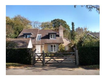
25A King's Road