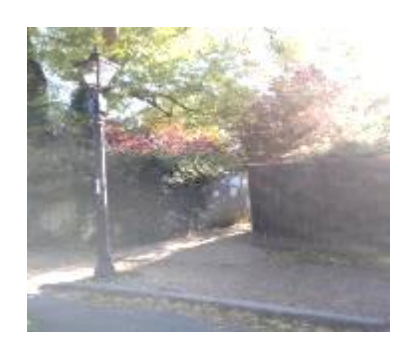
Alleyway Marlowe Road to Millington Lane