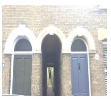
Selwyn Road, south side. Gaps between some of the terrace providing access to alleyways at the back

They are modest cottages with brick facades, flat fronts, slate roofs and two-over-two sash windows. There remain several original front doors. In recent years many loft extensions have been added.