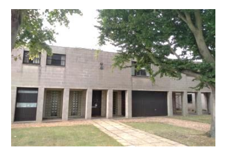
No. 2 Grantchester Road

C.3.7 Post-War. Nos. 2 and 2A Grantchester Road are Grade II Listed as a unit, in the Modernist style, having originally been the studio/office and home of the architect, Colin St. John Wilson (designer of the British Library in London). No. 19 has no back garden. No. 21 has been built in former back garden of no. 19.