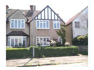
No. 5 Fulbrooke Road