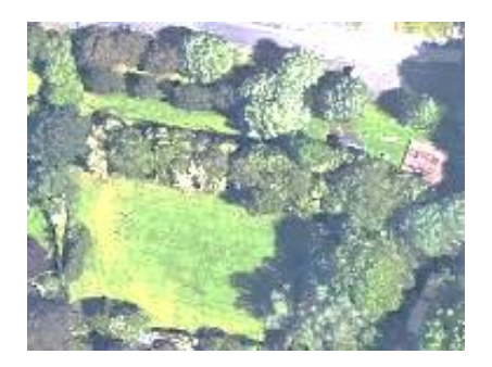
CHILDRENS PLAY AREA