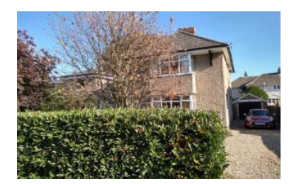
No. 31 Grantchester Rd.

C.3.7 Post-War. Nos. 2 and 2A Grantchester Road are Grade II Listed as a unit, in the Modernist style, having originally been the studio/office and home of the architect, Colin St. John Wilson (designer of the British Library in London). No. 19 has no back garden. No. 21 has been built in former back garden of no. 19.