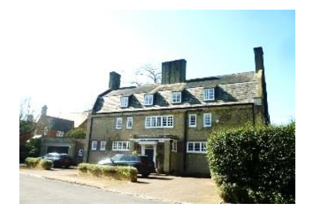
No. 6 c1914 neo Georgian