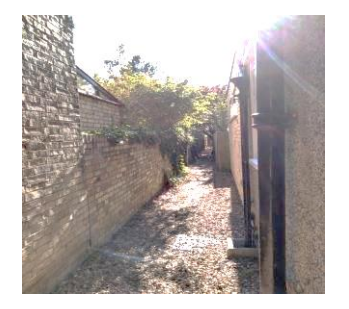
Residents' gardens access from Fulbrooke Road