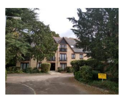
Ashworth Court, off King's Road

C.3.8 Contemporary 21st-Century. Original between-the-wars house demolished, and new house built (2019). Style with features referring to neighbouring properties though larger footprint