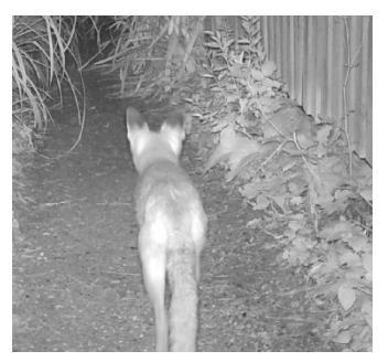
FOX IN SNICKET 3.30AM