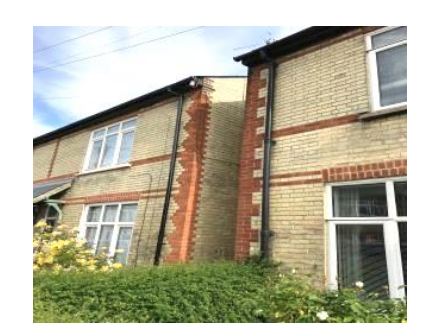
Brickwork detailing, Fulbrooke Road

C.3.4 Between the Wars: 1920s and 1930s Semi-detached or detached brick, pebbledash render and slate or tiled roofs. No. 50 Grantchester Road (a BLI) is an example of Arts and Craft style, with brick terracotta pantiles on a mansard roof.