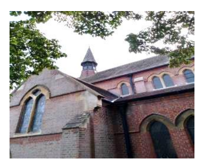
St. Mark's Church