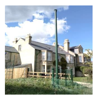
Stink Pipe Grantchester Meadows