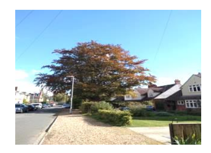
Semi-detached houses in Grantchester Meadows

A.3.5 Modern Flats and Student Accommodation A recent addition has been the development of student housing by Darwin College, replacing the old ambulance station. Traditional materials