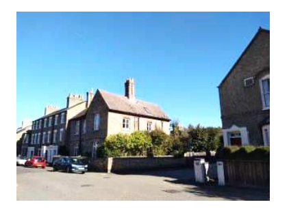
No. 31 Grantchester St. Detached House

Similar in age to Grantchester Street Victorian houses, No. 107 and 107a in Grantchester Meadows has stone defined canted bay windows.