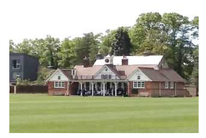
Gonville & Caius Cricket Pavilion

8. Gonville and Caius Cricket Pavilion (H8). In 1895 the College appointed the architect W.M. Fawcett to design a cricket pavilion which was completed by 1896. The original architectural elevations and drawings show lavish detailing of the brickwork, ornamental brackets and pillars supporting the veranda structure. Most of these features have been retained in subsequent alterations. The central clock tower and balustrade were later additions.