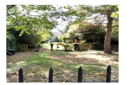
Back garden, Selwyn Road alleyway

C.3.6 1940s Detached houses on generous plots with garages. Mixture of facades, brick and pebbledash render. Slate and tile roofs. Front hedges and trees in gardens.