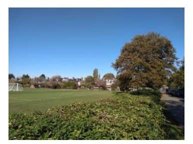
Downing College playing fields