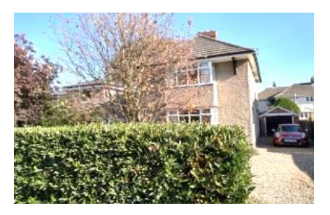
Nos. 19 and 21 Grantchester Road

There is a variety of detached houses on generous plots. Three-storey /Ashworth Park flats set in well-landscaped gardens.