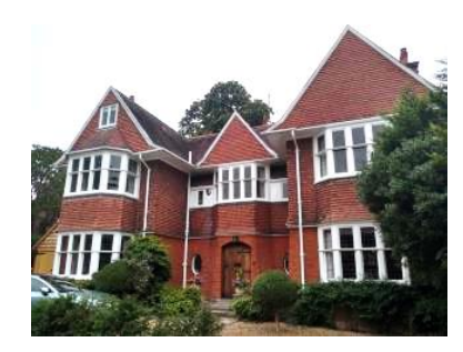
No. 3 Victorian/Edwardian