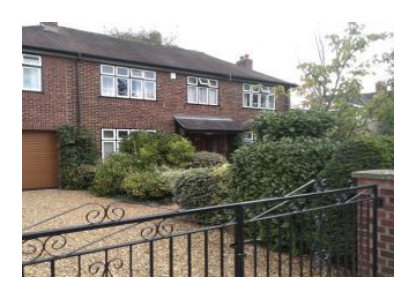
No. 27 Grantchester Rd

C.3.6 1940s Detached houses on generous plots with garages. Mixture of facades, brick and pebbledash render. Slate and tile roofs. Front hedges and trees in gardens.