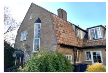
No. 50 Grantchester Road, Building of Local Interest (BLI) 1928 Architect H.C Hughes

C.3.5 Council-built 20th-century house. Council-built 20th-century terrace houses built along consistent building lines with medium-size front gardens and long back gardens. Some very well maintained. Garages and garden sheds at bottom of back gardens, leading onto the alleyway with access at one end to King's Road. Gault brick, pitched, tiled roofs, flat fronted, two-down and one-up, two-paned windows, wooden front door (many replaced).