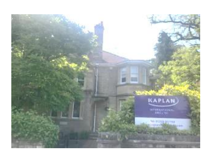
No. 1 Grantchester Rd.

C.3.1 Victorian detached house No. 1 Grantchester Road is a large Victorian house which was converted to a Language School in 1967 has Gault brick, bay windows and red tiled roof, set back from the road on a large plot, with mature trees and shrubs.