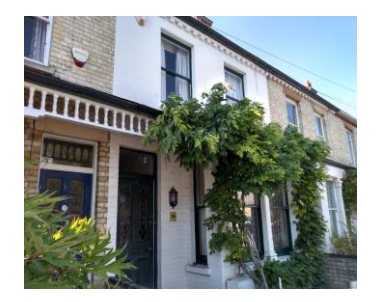
Nos. 32-36 Grantchester Rd