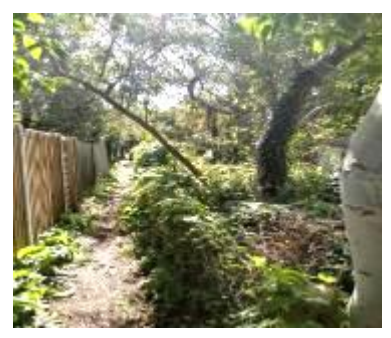
Alleyway Grantchester St. to Grantchester Meadows

Alleyways also run along the bottoms of gardens and were originally used for removing night soil in Victorian and Edwardian terraces and enable residents to bring bins out from back gardens onto the street for weekly collection, not to mention the early morning exits of illicit lovers. Residents at the end of alleyways where there is no further access, have sometimes fenced off that part of the alleyway which adjoins their property thus blocking off the end of the alleyway.