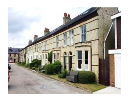
South End Green Road

A.3.3 Edwardian Period/Style Terraced Houses. Two storey terrace houses mostly built between 1904 and 1912 in the interlinking residential roads in the Croft. Medium sized plots with small front gardens with low stone walls, picket fencing and hedging and long back gardens. Set along consistent building lines. Facades of Gault brick, some with red brick dressings, under slate roofs. A few facades have been painted. Two storey front bays with sash windows and recessed front doors. Wide range of stone detailing, including names carved into the sandstone and stone arches over doorways. Details include inset boot scraper and cast-iron coal-chute covers.