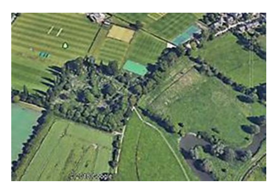
AERIAL VIEW OF SKATERS MEADOWS AND PEMBROKE ALLOTMENTS