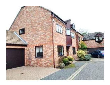
St. Marks Court