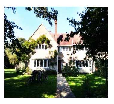
No 28 Barton Road

B.3.2 Arts and Craft Arts and Craft style house, pitched tiled roofs. Rough cast painted render façade. Metal Crittall windows and narrow oriel shaped windows. Curved brick porch surround and wooden front door.