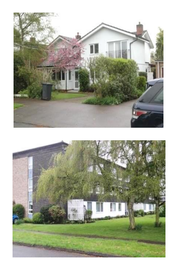
Larchfield Block of Flats