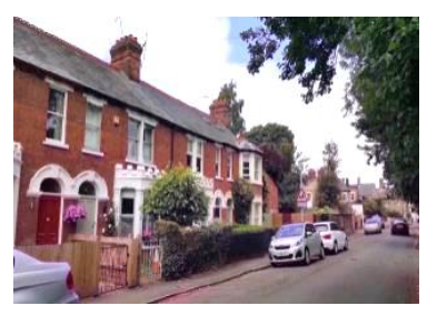
Two storey, red and gault brick Edwardian terrace houses in Grantchester Street

Grantchester Street runs through the heart of the Newnham Croft Conservation Area. There are three groups of terraced houses, well preserved, dating to the late 19<sup>th</sup> or early 20<sup>th</sup> centuries. Chedworth Street. The houses on the north side were built in 1913-1914 in Gault brick with some red brick detailing. Houses on the south side were built in 1992-93 replacing the original Newnham Croft School. The new school at the south-east end of the road opened in 1989. It is a simple modern style with brick and rendered elevations. Lammas Field . A development of a former hockey pitch in the 1970's by the Granta Housing Association. Single storey houses with courtyard gardens.