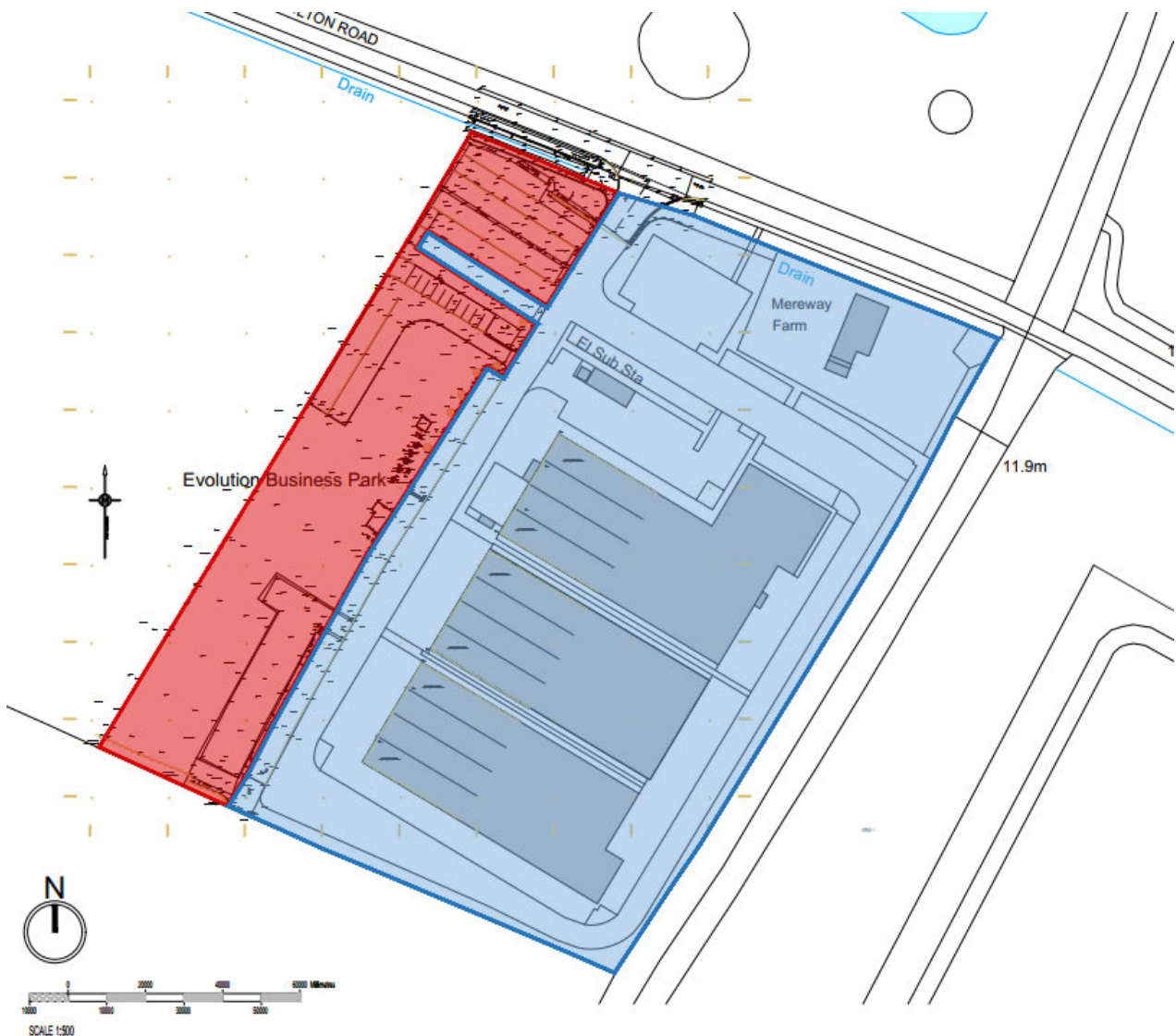
Figure 1: Existing Business Park (blue) and Developable Area (red)

In addition, our Client owns a parcel of associated land along the Park's western boundary comprising hard and soft landscaping and a car park, which is identified on the Site Location Plan (ref. AL0101 rev F02) submitted alongside this letter as an appendix. Figure 1, below, identifies the existing Evolution Business Park in blue and the additional developable land in red. There is demand for additional accommodation at the Park and the client is in active pre-application discussions with the Local Planning Authority regarding development of this parcel. These representations relate to Evolution Business Park and the land to the west of the Business Park and assess its ability to support the expansion of Evolution Business Park to meet growing business needs across the Local Plan period.