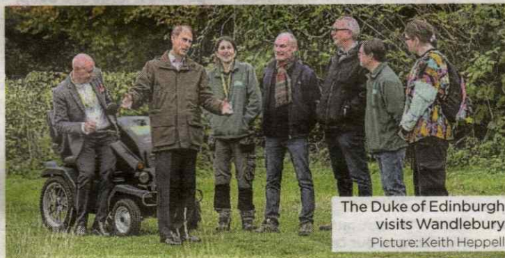
The Duke of Edinburgh visits Wandlebury

O ur councils have set out a draft plan to build the equivalent of a new Cambridge in 20 years.