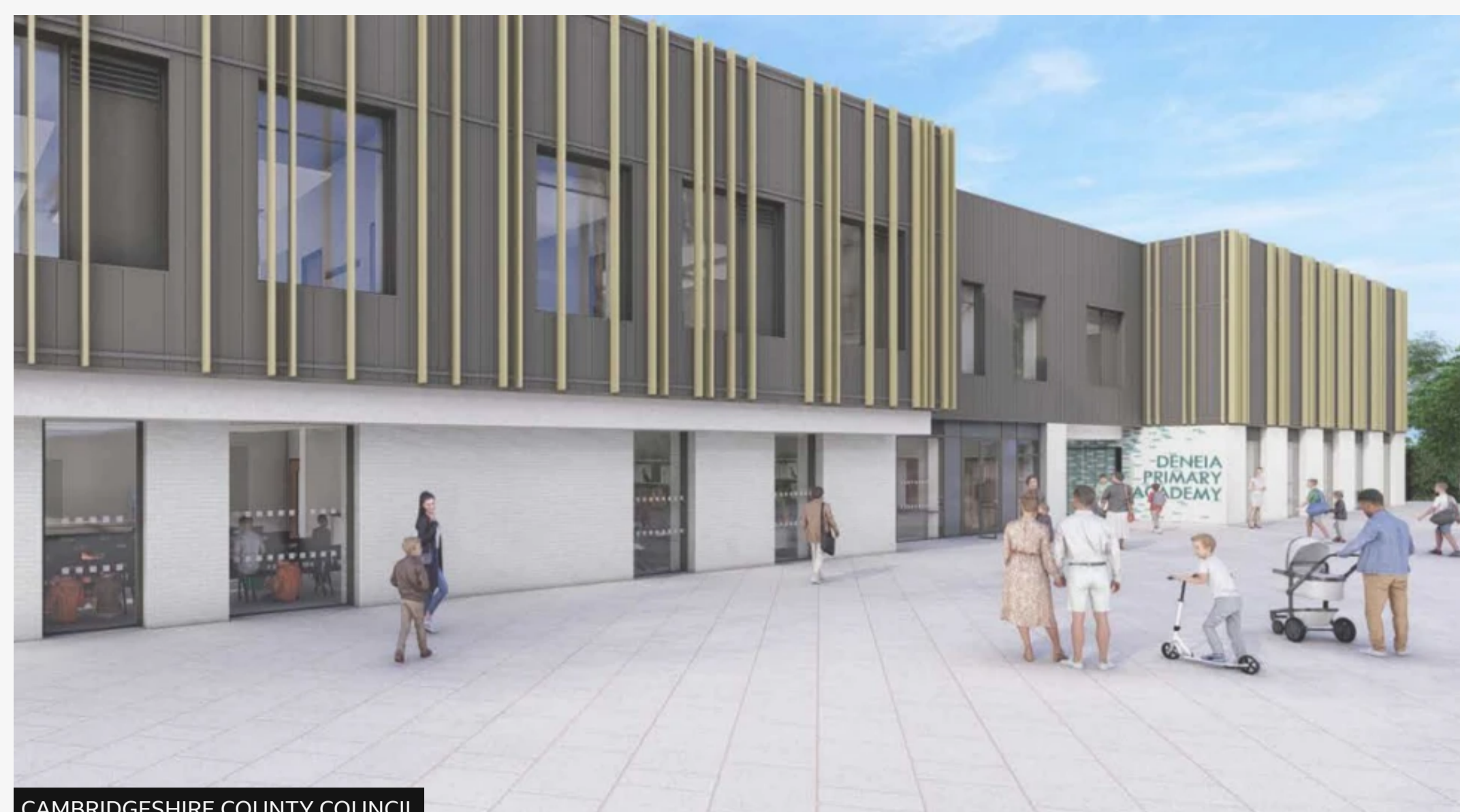
CAMBRIDGESHIRE COUNTY COUNCIL

Work was paused on Deneia Primary School in 2024