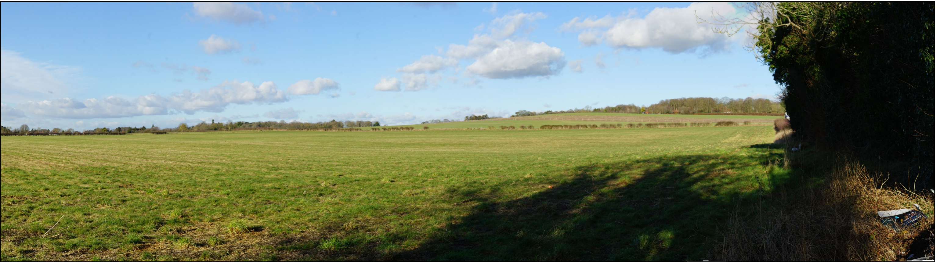
Viewpoint O - right