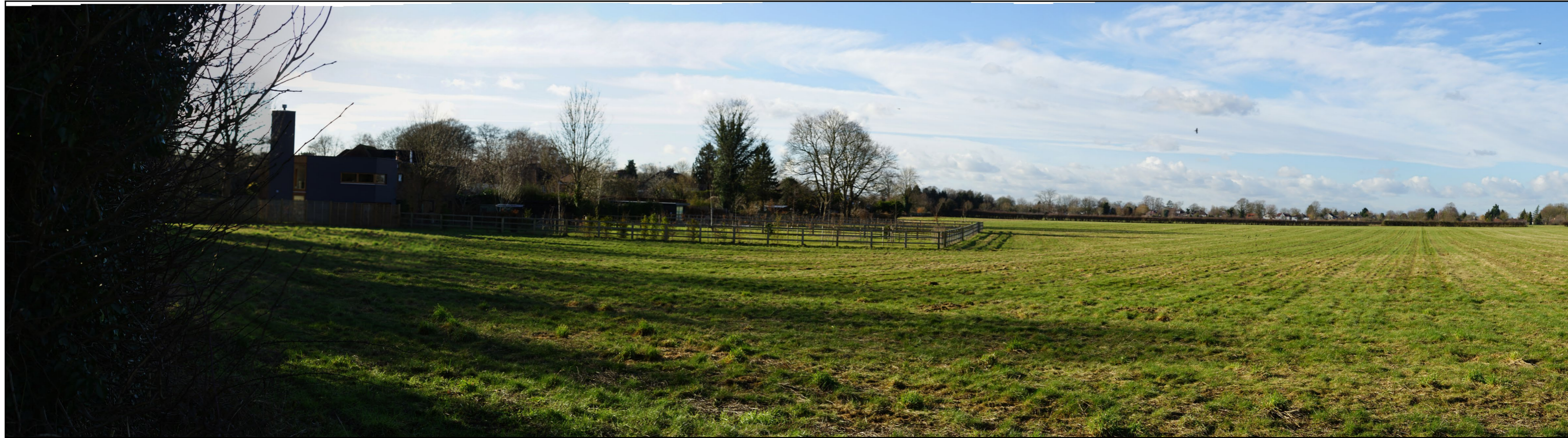
Viewpoint O - left