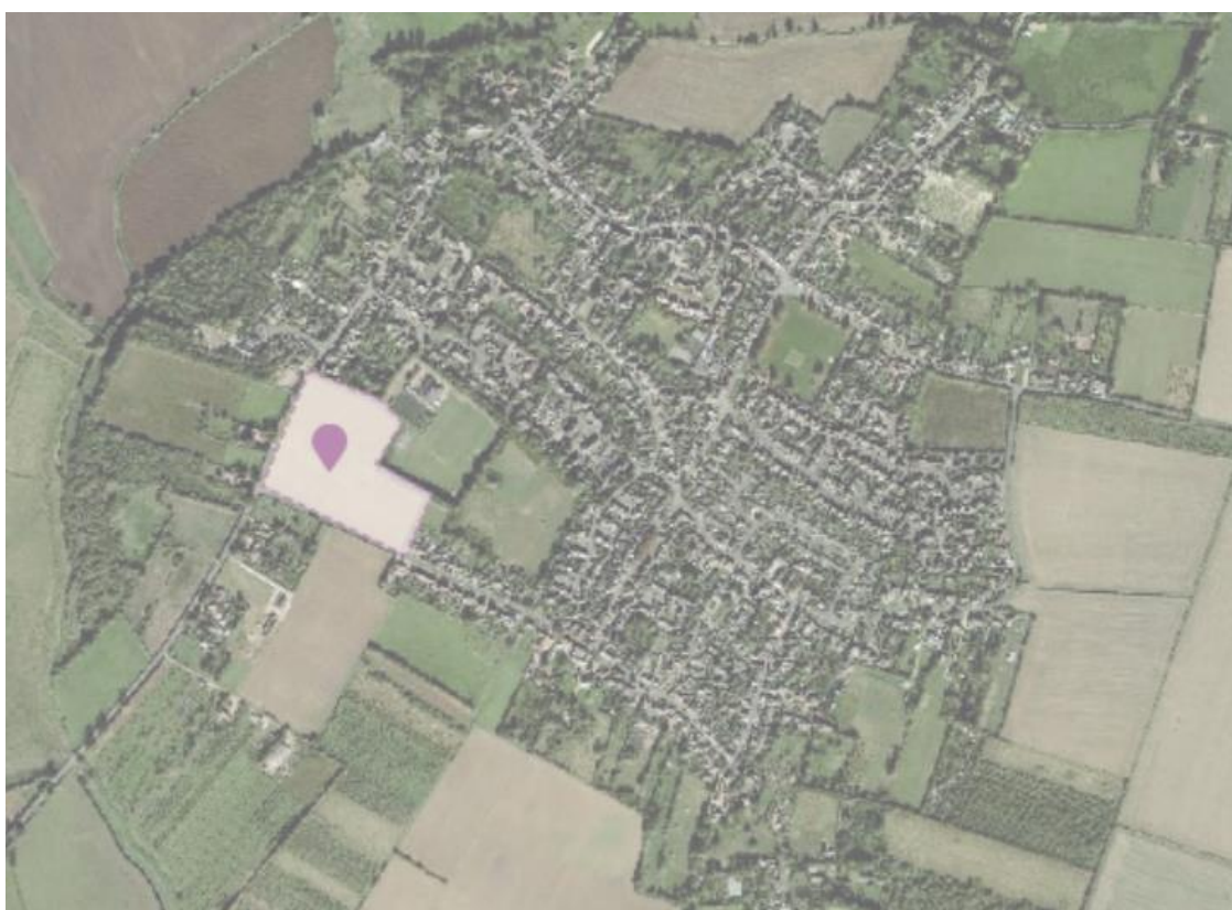
Figure 8: Land at Station Road, Over