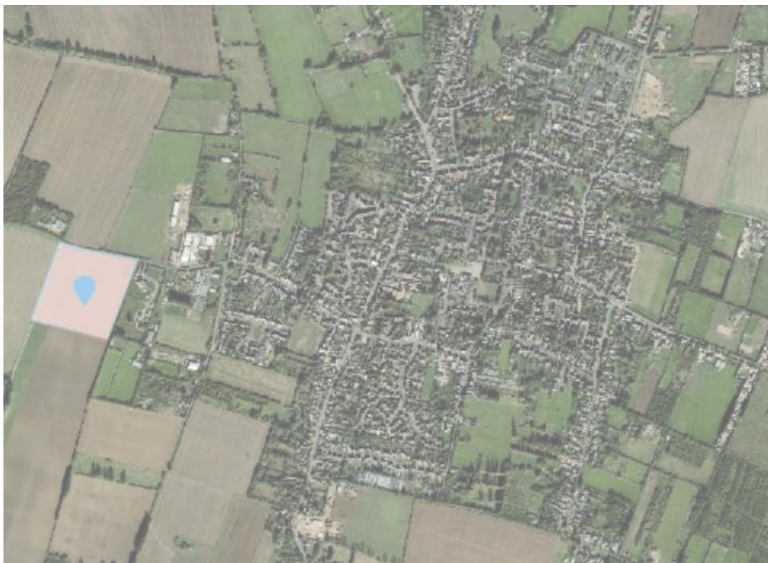
Figure 9: Land at Willingham Road, Willingham