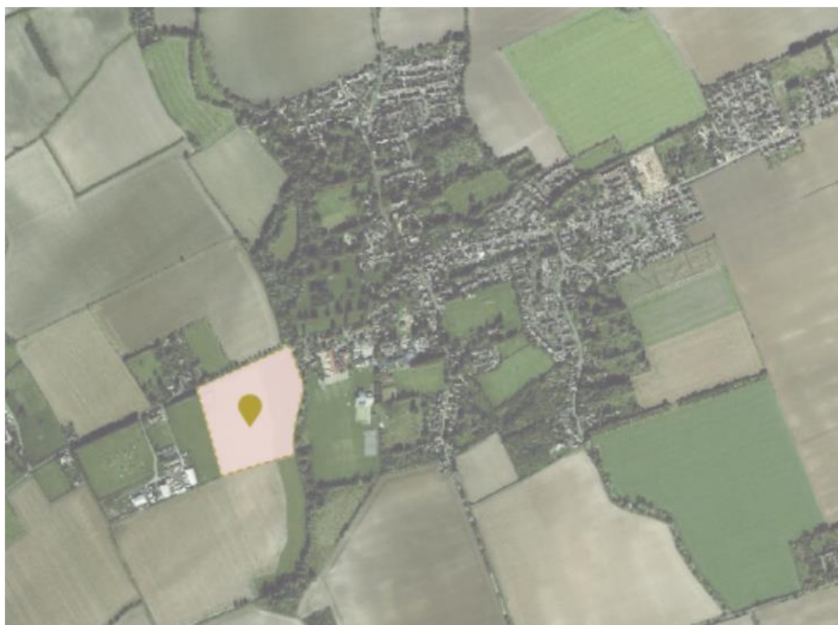
Figure 5: Land at Brook Road, Bassingbourn