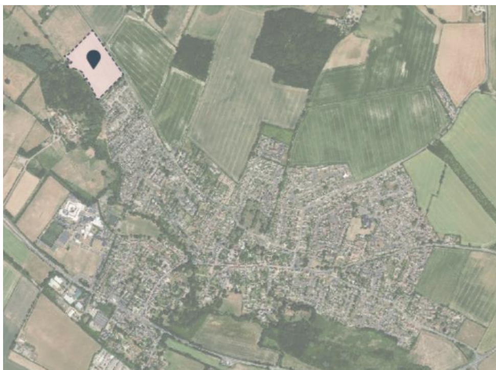
Figure 2: Land at Back Road, Linton