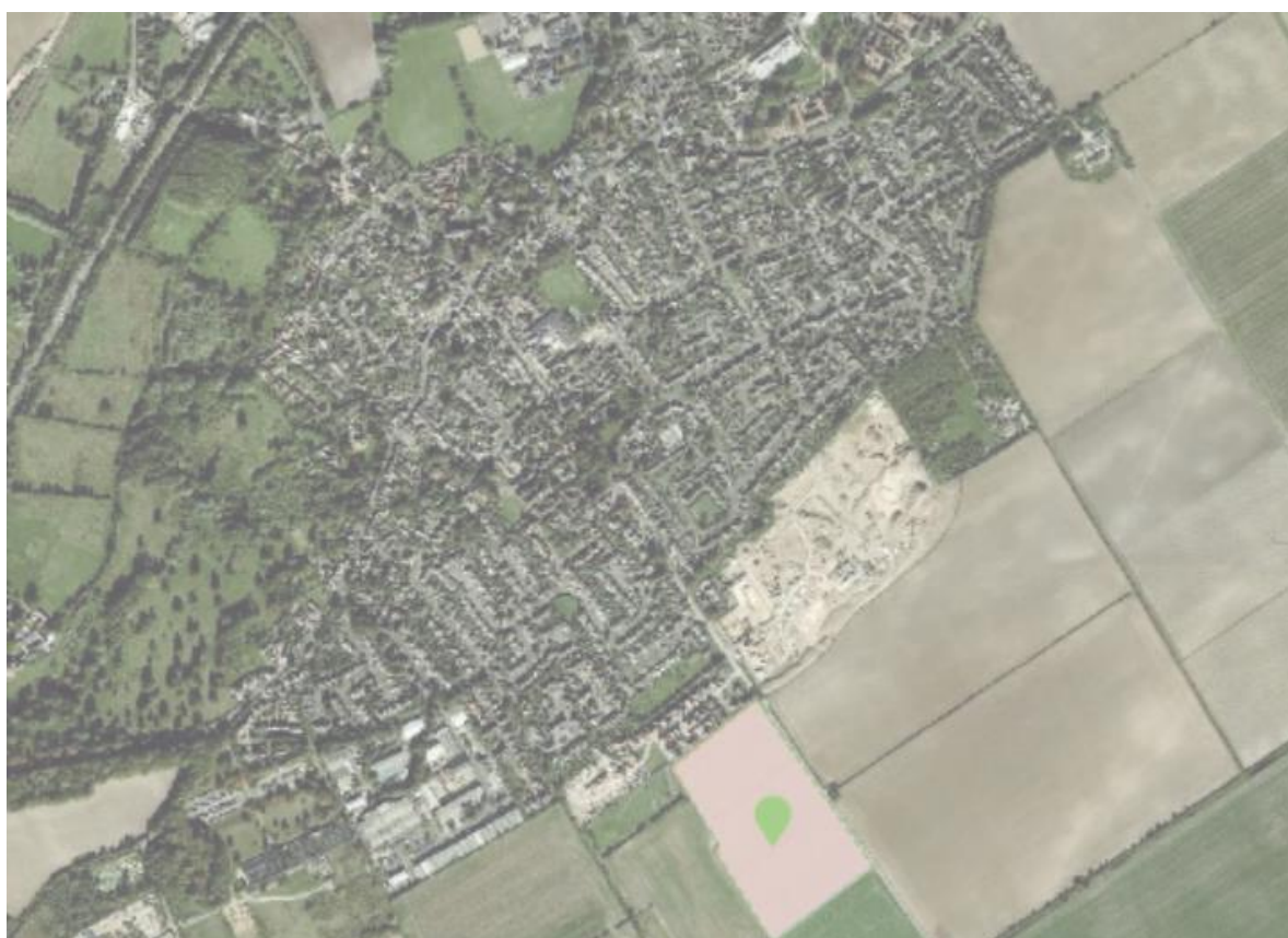
Figure 7: Land at New Road, Melbourn