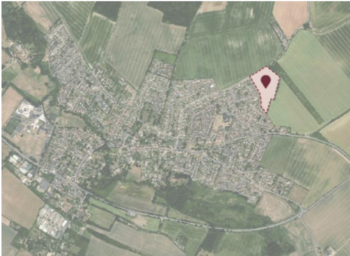
Figure 3: Land at Balsham Road, Linton