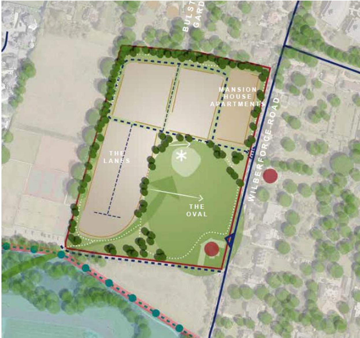
Plan: Concept Masterplan

3.9 Furthermore, the land is currently private and fenced off. As part of a redevelopment of the site, a significant area of open space would become available for public enjoyment; as a notable and tangible benefit to the locality. A matter of material weight to the assessment of the Protected Open Space; and a matter that could be included within any site allocation policy. The image below is a copy of the Concept Masterplan from the Issues and Options submission, which shows the broad area of public open space, which is substantial in size and would generate a public benefit against the existing facility which needs to be fenced off in its current use.