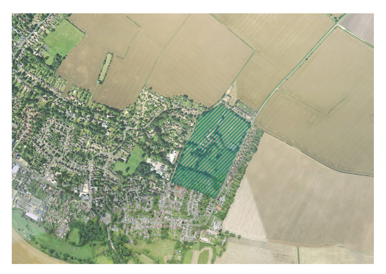
Figure 3 - Suggested area for Green belt Appraisal